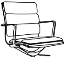
CHAIR BODY X 1