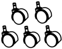
WHEELS X 5